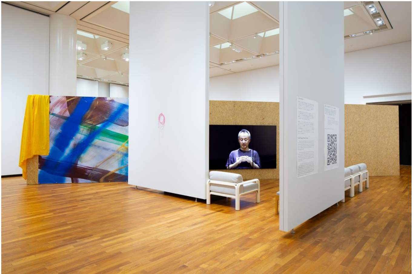
Koki Tanaka / Japan b.1975 / Abstracted / Family 2019 (installation view, 'Aichi Triennale 2019: Taming Y/Our Passion')

In late July 2019, the Sapporo International Art Festival announced the theme and title of its 2020 edition in Japanese, English and — for the first time — the language of the Ainu people indigenous to northern Japan. 1