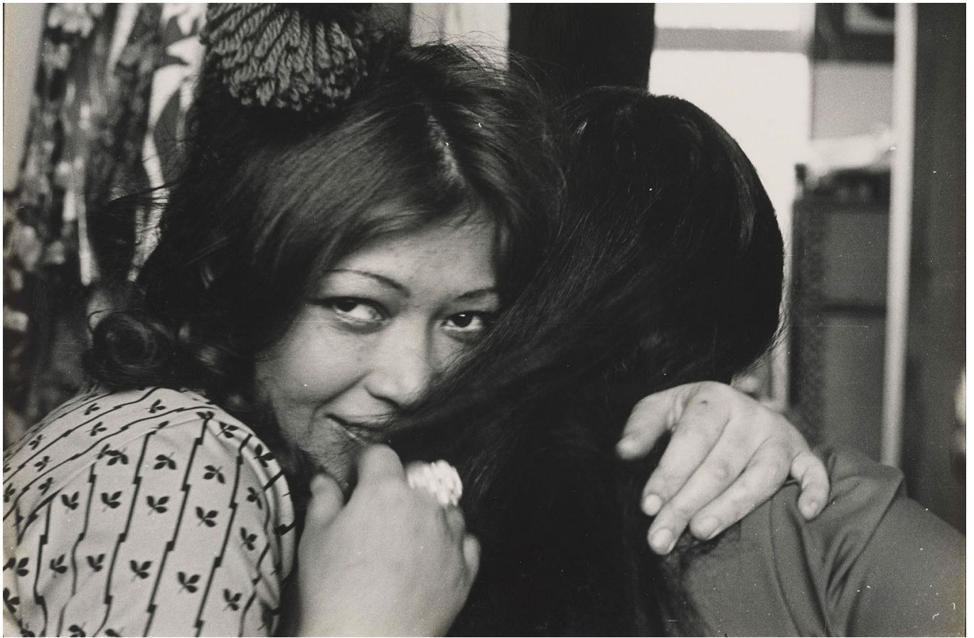
Mao Ishikawa / Japan b.1953 / Red Flower: The Women of Okinawa 1975-77 / Gelatin silver photograph on paper / 23.1 x 15.4cm / The Kenneth and Yasuko Myer Collection of Contemporary Asian Art. Purchased 2018 with funds from Michael Sidney Myer through the Queensland Art Gallery | Gallery of Modern Art Foundation / Collection: Queensland Art Gallery | Gallery of Modern Art, Brisbane / © Mao Ishikawa