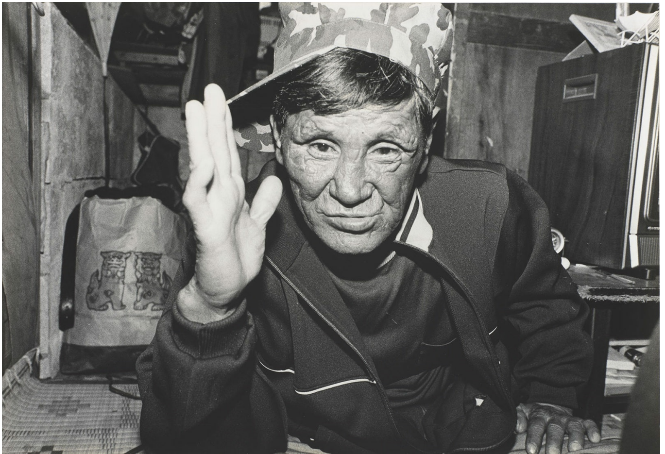
Mao Ishikawa / Japan b.1953 / A Port Town Elegy 1983–86 / Gelatin silver photograph on paper / 17.4 x 21.9cm / The Kenneth and Yasuko Myer Collection of Contemporary Asian Art. Purchased 2018 with funds from Michael Sidney Myer through the Queensland Art Gallery | Gallery of Modern Art Foundation / Collection: Queensland Art Gallery | Gallery of Modern Art, Brisbane / © Mao Ishikawa