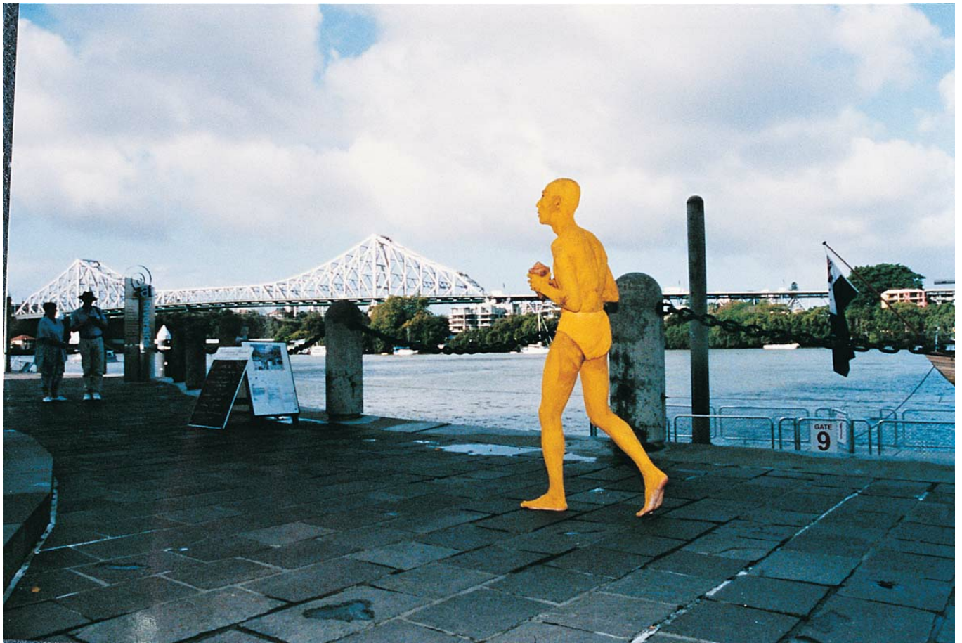
Lee Wen / Singapore 1957–2019 / Journey of a yellow man no. 13: Fragmented bodies/shifting ground (still) 1999 / Videotape: 10:30 minutes, colour, stereo / Purchased 2000. Queensland Art Gallery Foundation / Collection: Queensland Art Gallery | Gallery of Modern Art, Brisbane / ©Lee Wen