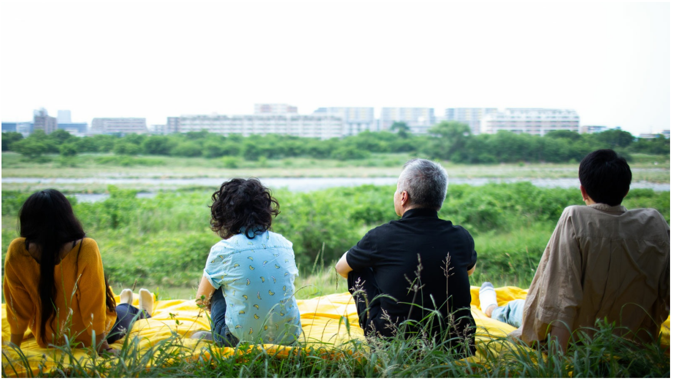
Koki Tanaka / Japan b.1975 / Abstracted / Family (still) 2019 / Image courtesy: Koki Tanaka

In the same triennale, Hikaru Fujii debuted a video documenting a workshop produced with Vietnamese students living in Japan that re-enacted the wartime 'Japanisation' exercises conducted in occupied Taiwan. Meanwhile, the journal Bijitsu Techō ( Art Notes ) devoted a substantial proportion of its August issue to profiling the art of Okinawa, the country's southernmost prefecture, whose shifting sovereignty has complicated its people's relationship to Japanese nationality — a situation exacerbated by the continuing presence of major US military installations. 2