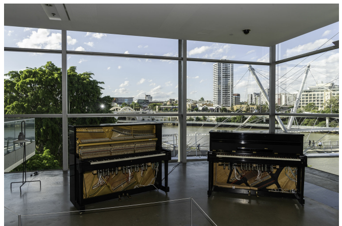
Yuko Mohri / Japan b.1980 / Breath or Echo 2017 / Pianos, solenoids, street lights, light bulbs, iron frames, ceramic insulators, concrete, cables, magnets, amplifiers, iPods, electric motors, wooden frame, roller system, paper, antennas, microphone stands, cables, magnets and horn speakers Installed dimensions variable / Purchased 2018 with funds from Tim Fairfax AC through the Queensland Art Gallery | Gallery of Modern Art Foundation / Collection: Queensland Art Gallery | Gallery of Modern Art, Brisbane / © Lee Ufan