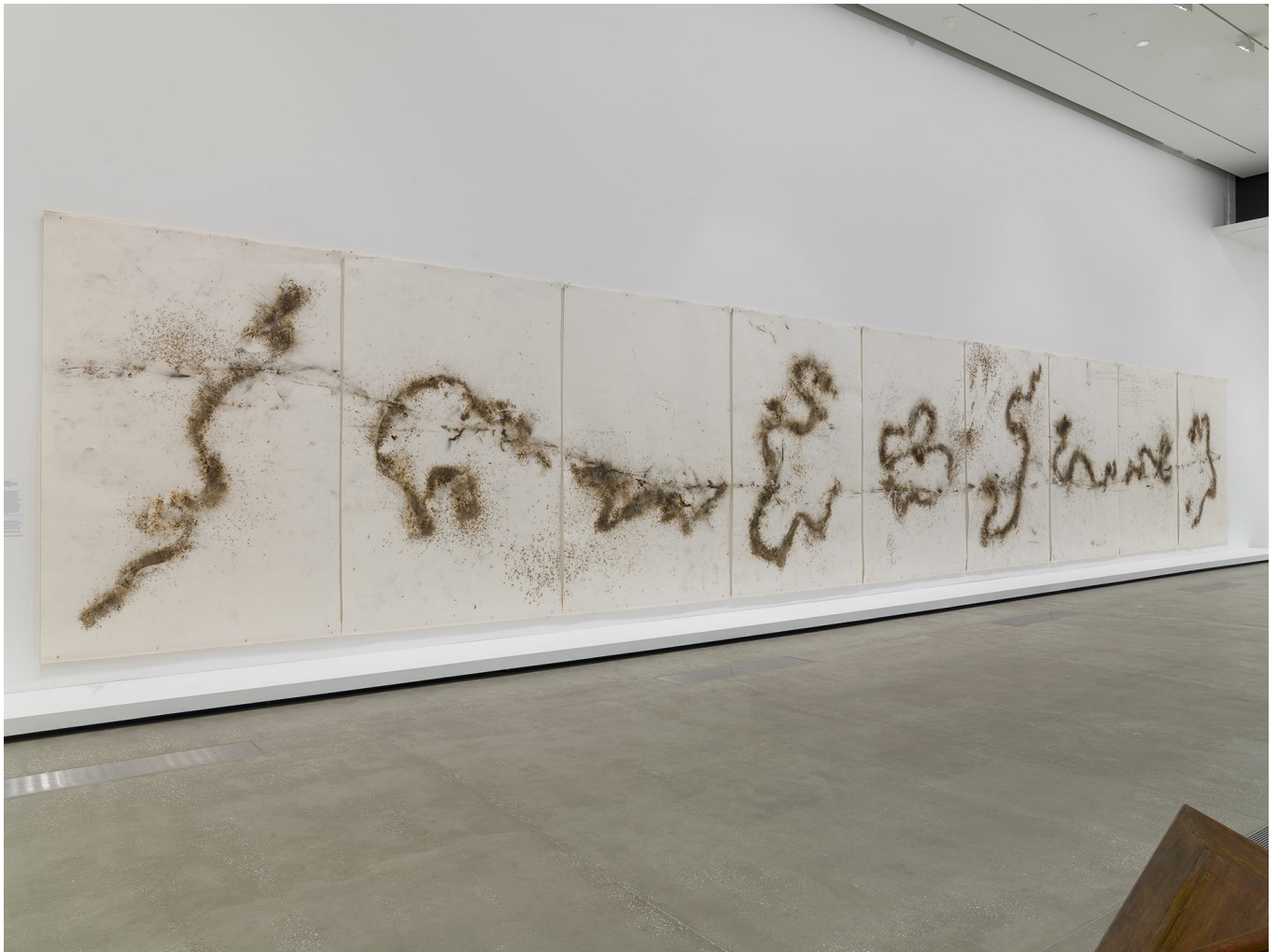
Cai Guo-Qiang / China b.1957 / Nine Dragon Wall ( Drawing for Dragon or Rainbow Serpent: A Myth Glorified or Feared: Project for Extraterrestrials No. 28) 1996 / Spent gunpowder and Indian ink on Japanese paper / Nine sheets: 300 x 200cm (each); 300 x 1800cm (overall) / Purchased 1996 / Collection: Queensland Art Gallery | Gallery of Modern Art, Brisbane / © Cai Guo-Qiang