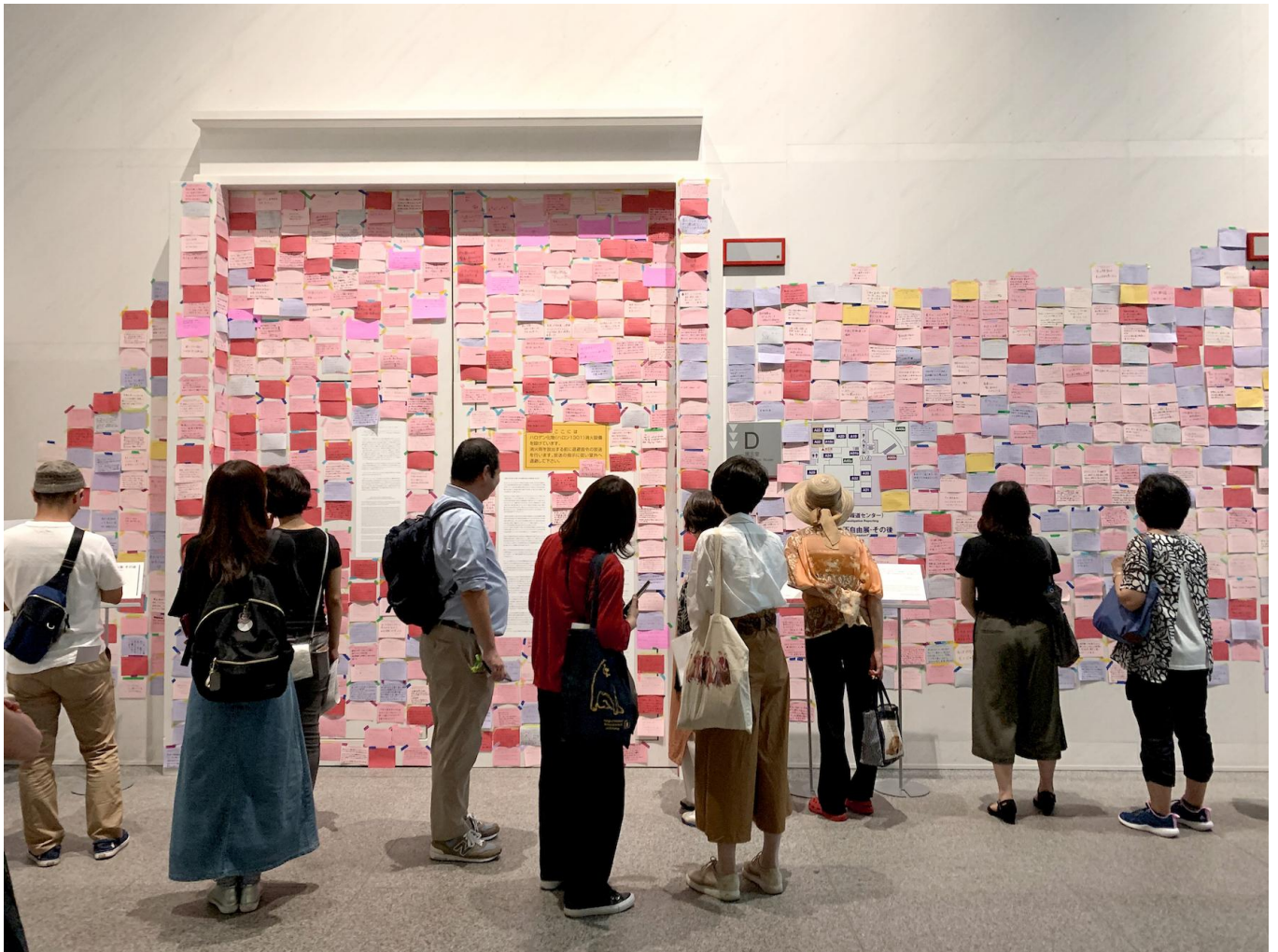
Re_FreedomAichi, #YOuRFreedom collaboration between artists and exhibitions visitors of the Aichi Triennale 2019