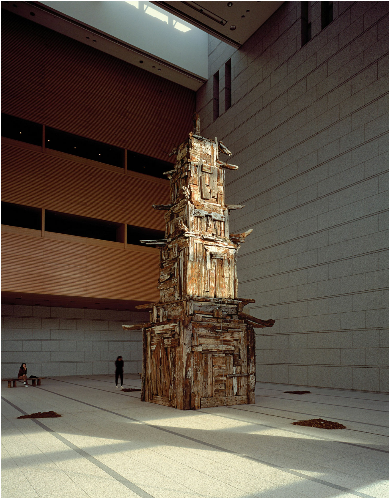
Cai Guo-Qiang / China b.1957 / The Orient (San Jō Tower) 1995 (installation view at 'Art in Japan Today', Museum of Contemporary Art, Tokyo / Salvaged wood from a sunken boat, seismograph and soil / Installation dimensions variable