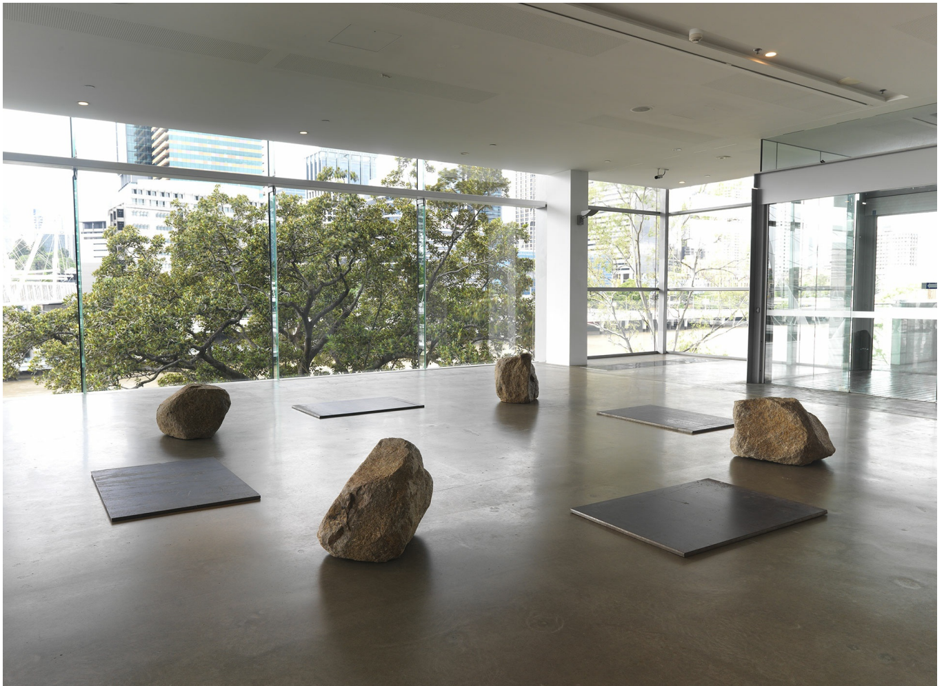
Lee Ufan / South Korea/Japan b.1936 / Relatum 2002 / Iron plates, stones / 57 x 536 x 526cm (installed); four iron plates: 2 x 120 x 80cm (each); four stones: 57 x 57 x 58cm; 52 x 75 x 52cm; 44 x 69 x 53cm; 49 x 70 x 49cm / The Kenneth and Yasuko Myer Collection of Contemporary Asian Art. Purchased 2002 with funds from The Myer Foundation, a project of the Sidney Myer Centenary Celebration 1899–1999, through the Queensland Art Gallery Foundation / Collection: Queensland Art Gallery | Gallery of Modern Art, Brisbane / ©Lee Ufan

There are, of course, notable exceptions to the idea that art in Japan is homogenous. Lee Ufan, who first moved to Japan from Korea in 1956, at the age of 20, played an outsized role in the development of Japanese contemporary art, most prominently as a theorist and spokesperson for the highly influential Mono-ha (School of Things) movement of the late 1960s and early 1970s. Chinese artist Cai Guo-Qiang relocated to Tsukuba in 1986, where he embarked on an attention-grabbing series of projects that earned him a place in the 1995 exhibition 'Art in Japan Today', which opened the Museum of Contemporary Art, Tokyo. The command N collective, established in 1998, was particularly cosmopolitan, its number including Tokyo-based artists from a range of nationalities, such as Myeong-eun Shin from Korea, Lee Wen from Singapore, and English artist Peter Bellars. The broader composition of the Japanese art world has, however, been less diverse. 6