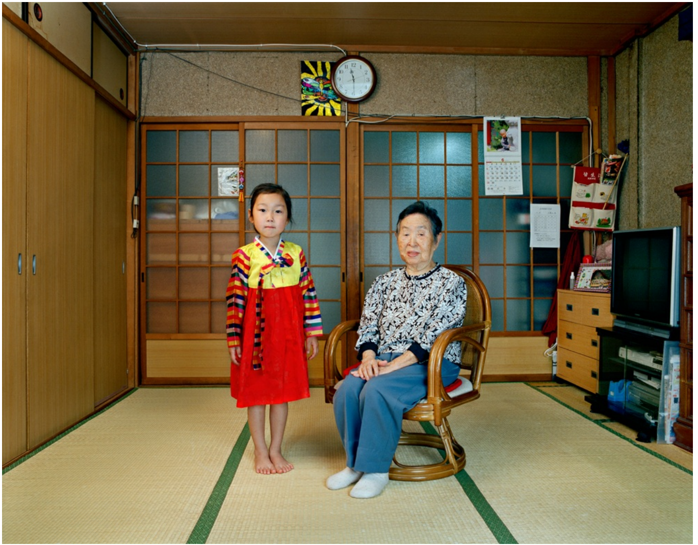
Kim Insook / Korea b.1978 / SAIESEO: Between two Koreas and Japan, Great-grandmother and I 2008 / Chromogenic print / 118 x 150cm / Collection: Tokyo Photographic Art Museum / Image courtesy: Kim Insook