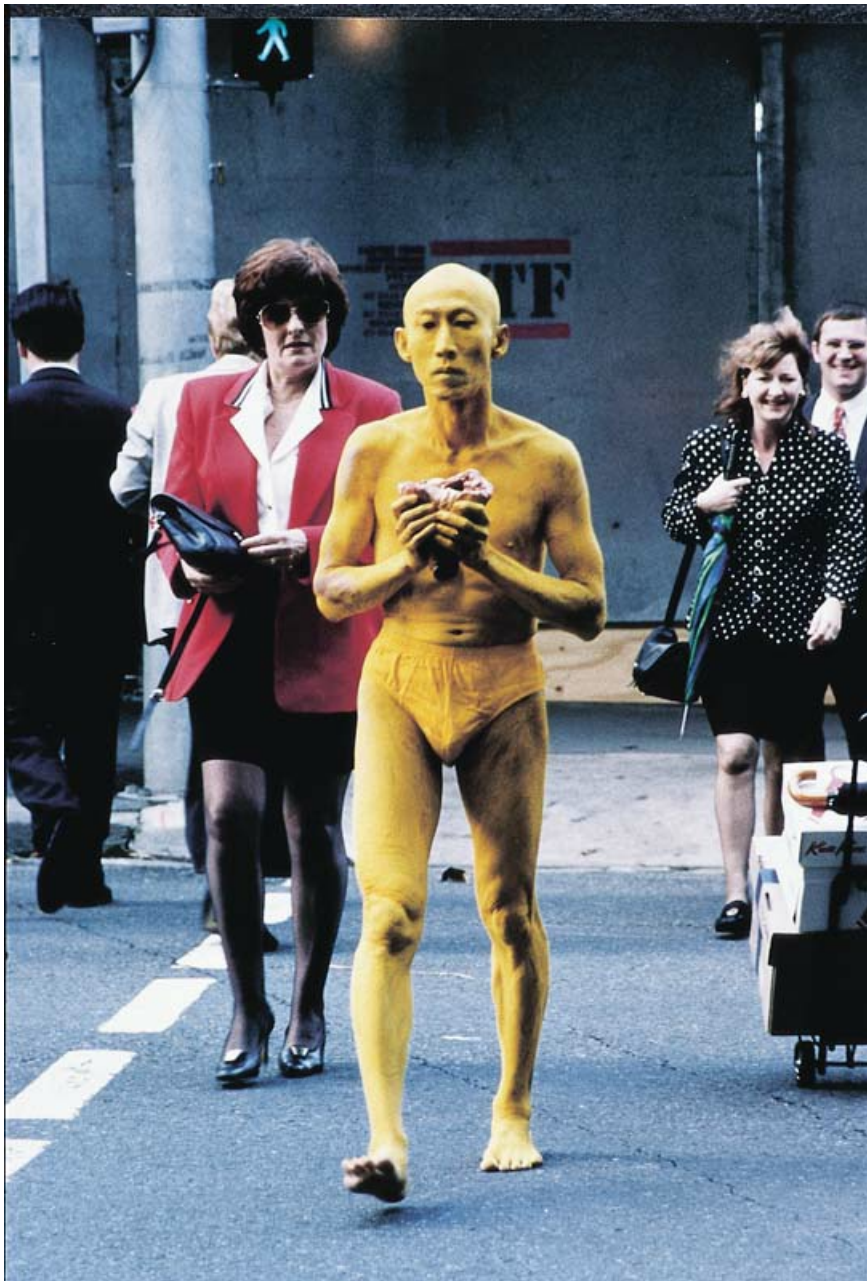
Lee Wen / Singapore 1957–2019 / Journey of a yellow man no. 13: Fragmented bodies/shifting ground (still) 1999 / Videotape: 10:30 minutes, colour, stereo / Purchased 2000. Queensland Art Gallery Foundation / Collection: Queensland Art Gallery | Gallery of Modern Art, Brisbane / ©Lee Wen